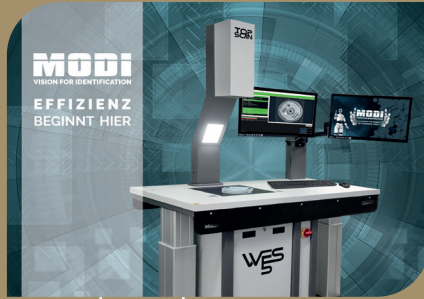
WES V5 - Incoming Good System